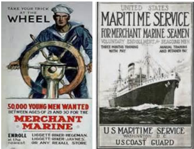
Vintage Merchant Marine recruiting posters Summer 2015 Halyards