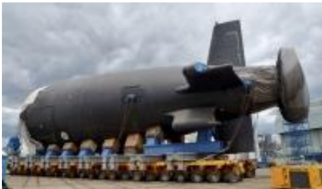
USS Colorado stern hull section arrived at Groton from Electric Boat's Quonset Point facility earlier this year