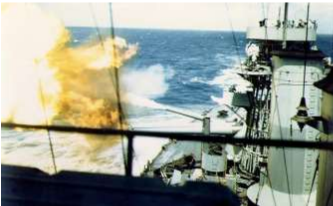
USS Colorado (BB-45) 16-inch guns

The third USS Colorado (BB-45) was a 625-foot-long, 32,600-ton battleship (first of its class) commissioned in August, 1923, in New Jersey. She saw significant action in the Pacific, and reportedly fired more 16-inch shells than any other battleship. Thanks to the effort of the USS Colorado (BB-45) Association, that noble battleship's bell and helm were placed on display in the Lounge of the University of Colorado Memorial Center in Boulder. The Memorial Center was declared by the Colorado Governor in 1947 to be "a memorial to those who served in these great wars."