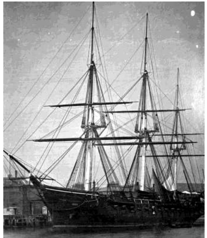
USS Colorado (1858 frigate)

A brief review: The first USS Colorado was a Federal 44-gun, three-masted, 3480-ton, steam frigate , commissioned in 1858 to enforce Federal blockades against Confederate trade in the waters of the Gulf of Mexico, the Caribbean and the Carolinas, English waters, and the Mediterranean Sea. She later served as the flagship of the European and the Asiatic Squadrons.